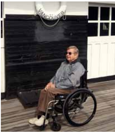
From Auto West BMW in Richmond to Lake Louise for canoe races and the final banquet in Vancouver, old friends where happy to meet again, and many new friendships developed.