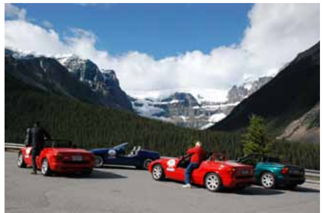
Top: The Expedition group awaiting the Vancouver to Victoria ferry at the Tsawwassen Terminal near Vancouver. Bottom left: Butchart Garden near Victoria was an early Expedition highlight. Bottom right: Four of the seven Zetties stopped to view the Columbia Icefields en route to Lake Louise.